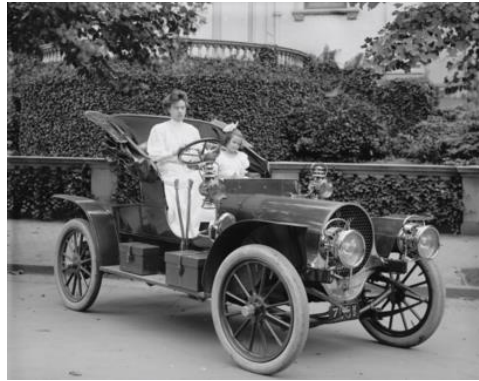
Figure 1: 1907 Franklin Model D roadster. Photograph by Harris & Ewing, Inc. [Public domain], via Wikimedia Commons. ( https://goo.gl/VLCRBB )