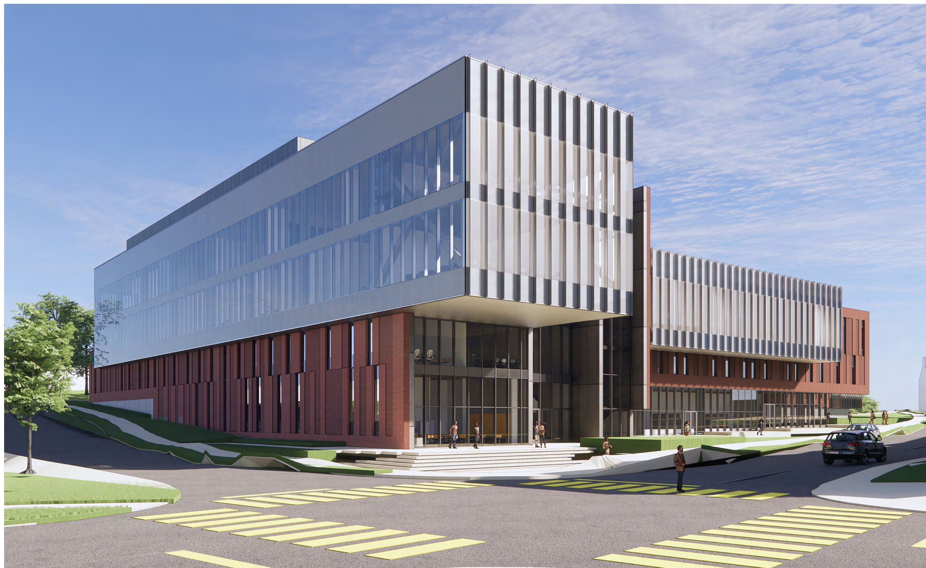
VIEW FROM 8TH AND MARION ST