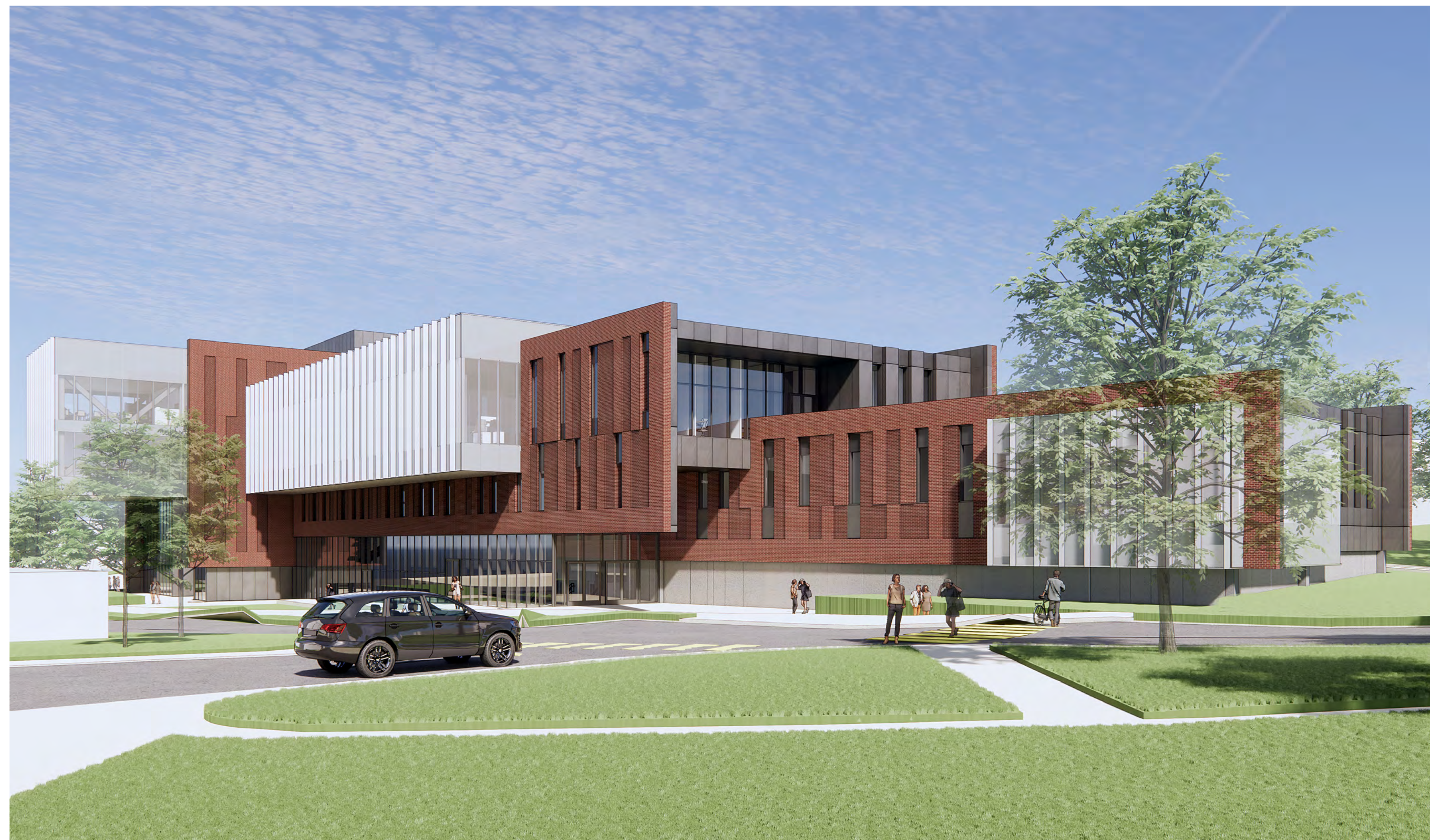
VIEW FROM JACKSON ALLEY