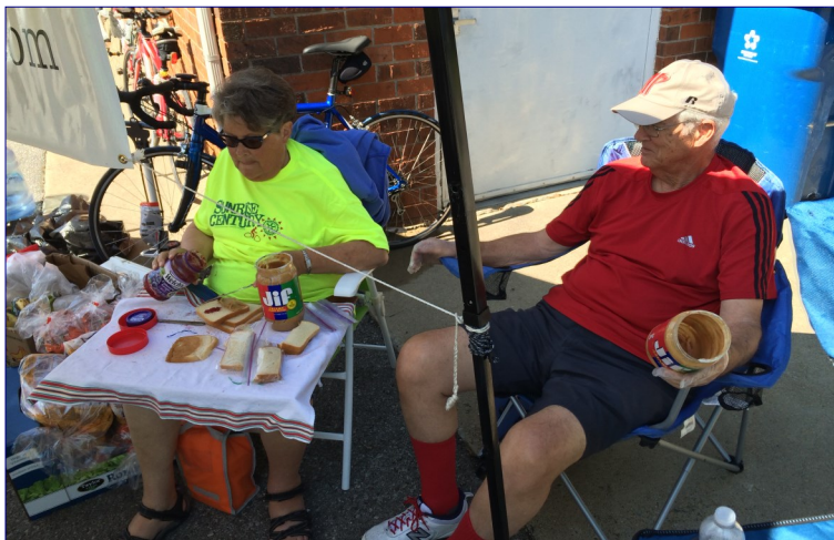
Not your usu- al bike ride participant