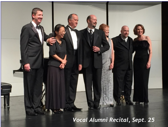
Vocal Alumni Recital, Sept. 25