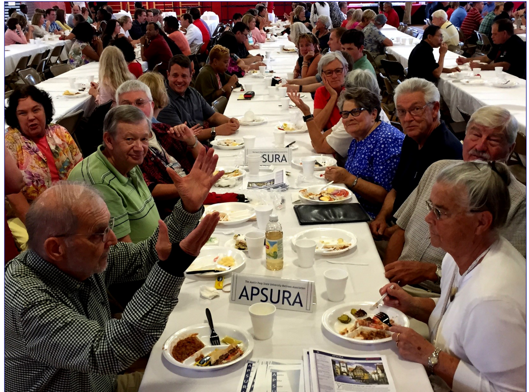
Photo: APSURANS having a good time at the Convocation picnic, August 19, 2015.