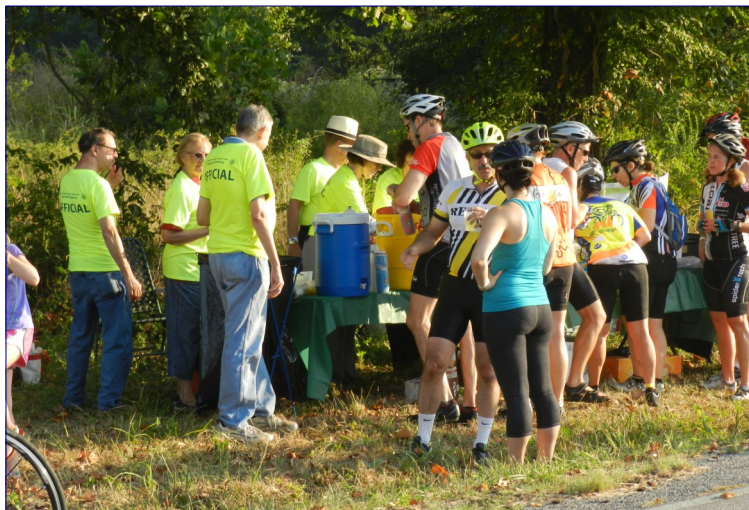
The first wave of bicyclists at our rest stop on Webb Rd.

We served around 800 bikers over three hours or so. Several of us have staffed the Webb Road stop for years, and we always look forward to watching the colorful bikers stream in and sending them on their way refueled and refreshed. They always thank us for our assistance, too.