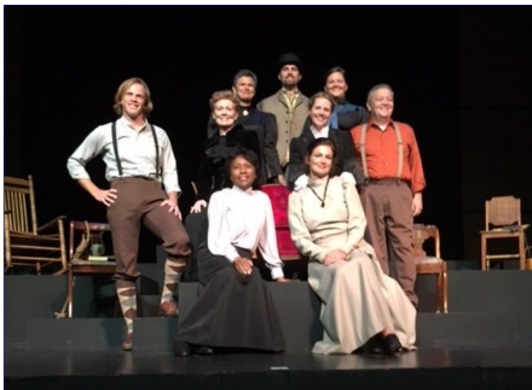
Cast of musical drama Voices, Sept. 4