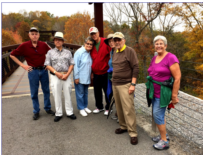
APSURANS walking the Greenway on Oct. 25

We learned that the trail had been extended over another mile to the north, but we did not go that far. For some reason, our walking pace seems each year to become more leisurely. We don't quite understand this phenomenon, but maybe some of our readers can supply a reasonable explanation. Our outing concluded with an enjoyable group brunch at Silke's.