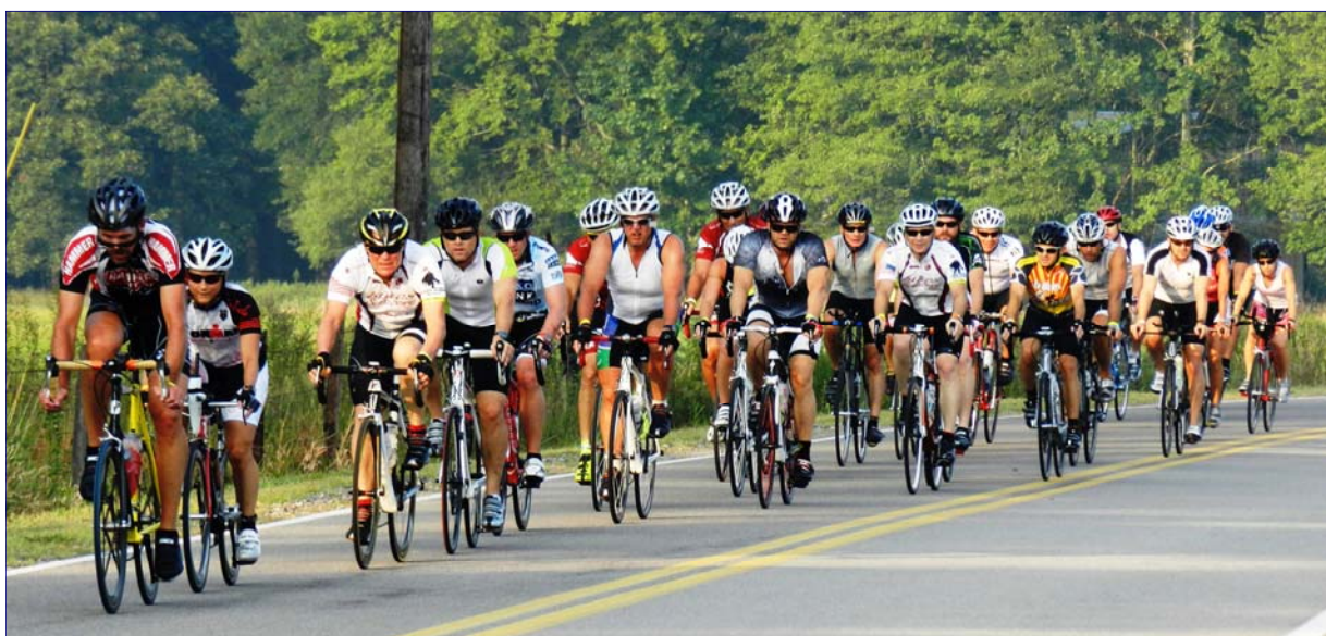
A few of the nearly 1,000 cyclists in last year's Bike Ride