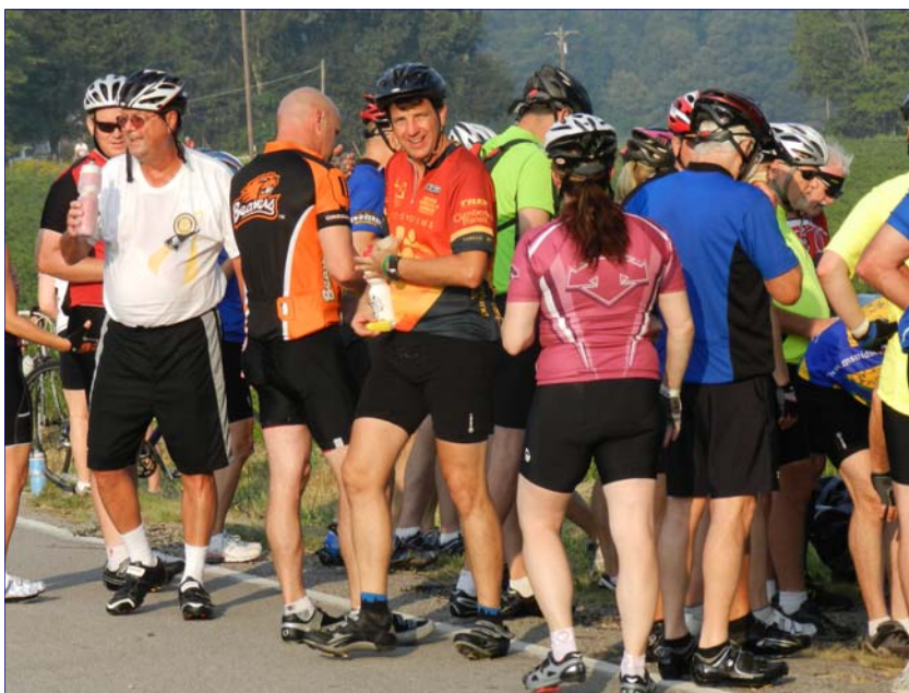
Riders briefly mobbing our rest stop on Sept. 3 of last year

to a rest stop, or perhaps ask you to assist in early-morning registration of the bikers, and provide the necessary materials and provisions. Those of us who participated last year are confident that you will enjoy this day.